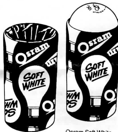
Osram Soft White