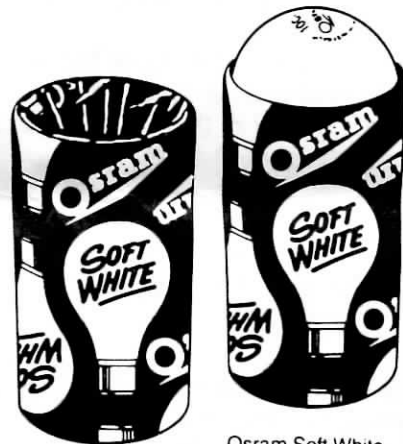
Osram Soft White

time has filled a similar role with the East Victoria Park Pharmacy.