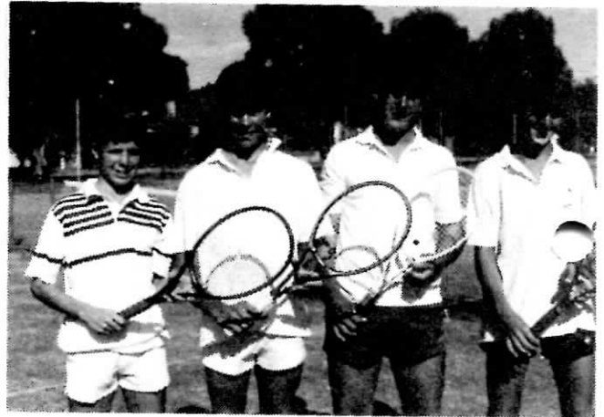
Members of our winning Sunday Boys 18/U Div. 5 pennant team

It is most important for the Club that good relationships are maintained with all our neighbours. I would ask members to park only on Club premises (not in the four Committee bays though!) or in the adjacent streets. There is always parking on the Club side of Coode Street available and members can come through the laneway or across the back of the courts. Your co-operation would be appreciated.