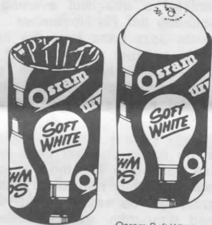
Osram Soft White